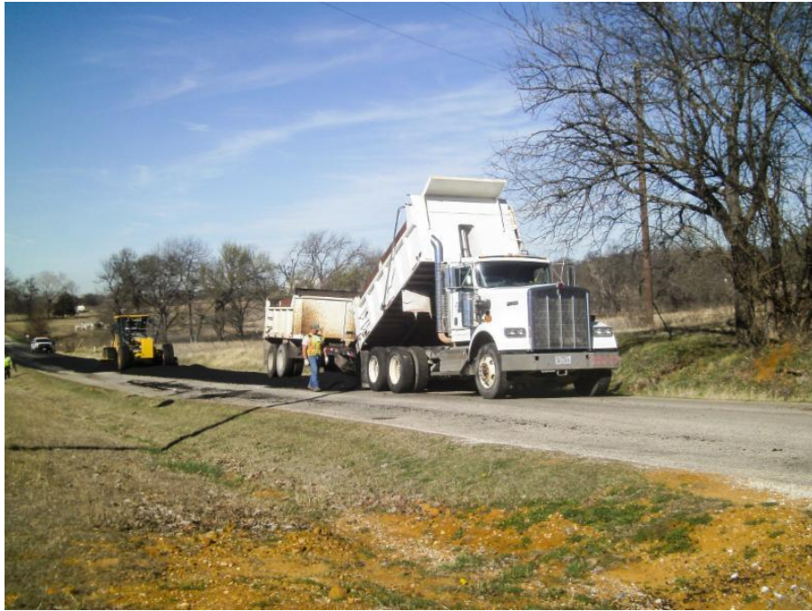
Repairing base failures on Liberty Road.