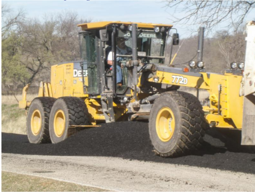
Repairing base failures on Liberty Road.