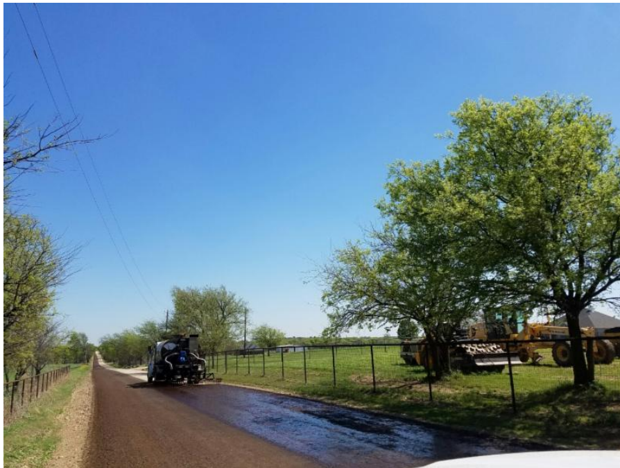
Priming on Chisum Road.