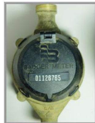
The meter number is located on the lid of the meter

Your water meter is typically located in the ground, along property lines, and near the street (or sidewalk). Once the meter box lid has been removed, you will want to make sure you are looking at the correct meter. You want to match the meter number on your water bill with the meter number on the meter lid. Once you're sure you're looking at the correct meter, you're ready to write down the beginning read. From the odometer-like readout, write down the numbers from left to right, taking note that some of the numbers have a white background and some of the numbers have a black background. When you get to the last digit on the right (a zero), upon close inspection you will notice that the number does not roll over like the higher place digits do. That's because this zero is just a placeholder, and the sweep hand on the face of the dial indicates which number to write instead. So if the sweep hand is pointing at the "2" on the face of the dial, then the last digit on the readout would be written "2". If the sweep hand is pointing at the "3", the last digit of the readout would be written "3". The hash marks on the dial are incremented in tenths of a gallon, so if the sweep hand is somewhere in between the "2" and the "3", you simply count the number of hash marks, add a decimal point after the "2", and write down the number of tenths. Confused yet? Let's look at an actual meter for practice.